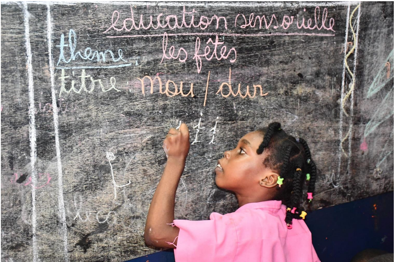
A girl child refugee with a disability participates in an inclusive classroom. Source: UNHCR, Gabriel Tekumafor, Douala, Cameroon, 2019.

Girls and boys with disabilities are often forgotten by humanitarian aid and face greater marginalisation in a context of dwindling resources. xlii They often do not receive any form of education or psychosocial support and remain inadequately included in emergency programmes xliii . School attacks or takeovers can even reverse progress on inclusion, pushing previously included children with disabilities into domestic isolation or exploitative activities, such as street work and begging. xliv