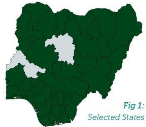
Fig 1: Selected States

Neglected Tropical Diseases (NTDs) can affect the skin, causing chronic and lifelong disability in affected persons when untreated. Affected persons usually present for treatment at health facilities when the diseases have reached advanced stages, thereby increasing the incidence of life altering morbidity and disability. Cases of skin NTDs are usually hidden in communities due to poor awareness of the conditions and the stigma associated with them. Early detection of skin NTDs is important to reduce the adverse health impacts caused by delays in the diagnosis, referral, treatment and management of affected persons. In Nigeria, many skin NTDs are not prioritized due to the vertical and uncoordinated mobilization of resources for chronic NTD programmes (AIM, 2018a). The World Health Organization's (WHO) Department for the Control of NTDs proposed the integration of programme implementation for more effective and efficient management.