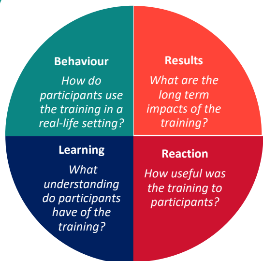
Fig.3 Kirkpatrick Evaluation Framework for Training